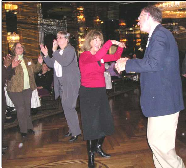
Everyone has a great time dancing to Motown and More!