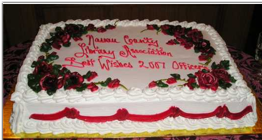
Cake to congratulate the NCLA 2007 Officers.