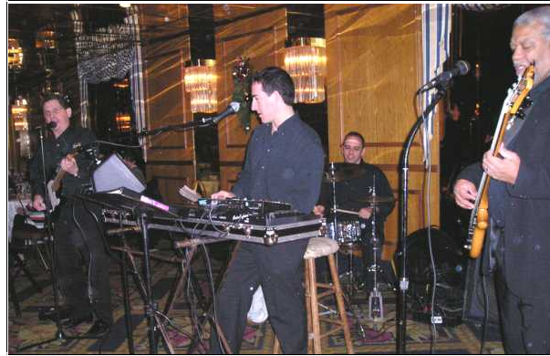
Music is provided by Motown and More.