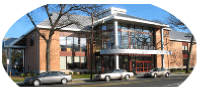
The Merrick Library