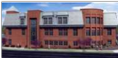
Manhasset Public Library

The Technical Services Committee of NCLA organized a tour to two of Nassau's newest libraries. Over twenty people signed up for the program, including Reference, Circulation and Technical Services staff. We visited Manhasset Public Library in the morning and Merrick Library in the afternoon. We were taken on a tour of the new buildings, including a look at the processing of materials for RFID (radio frequency identification), as well as a demonstration of self-checkout with RFID.