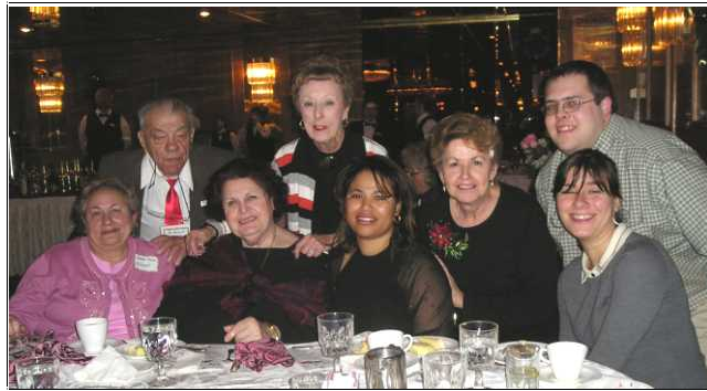
Staff of the Elmont Public Library at the Annual Dinner.