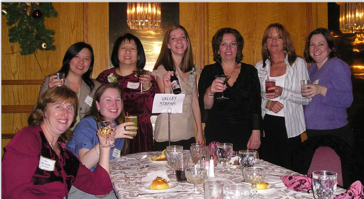
Staff of the Henry Waldinger Memorial Library (Valley Stream) is ready to party!