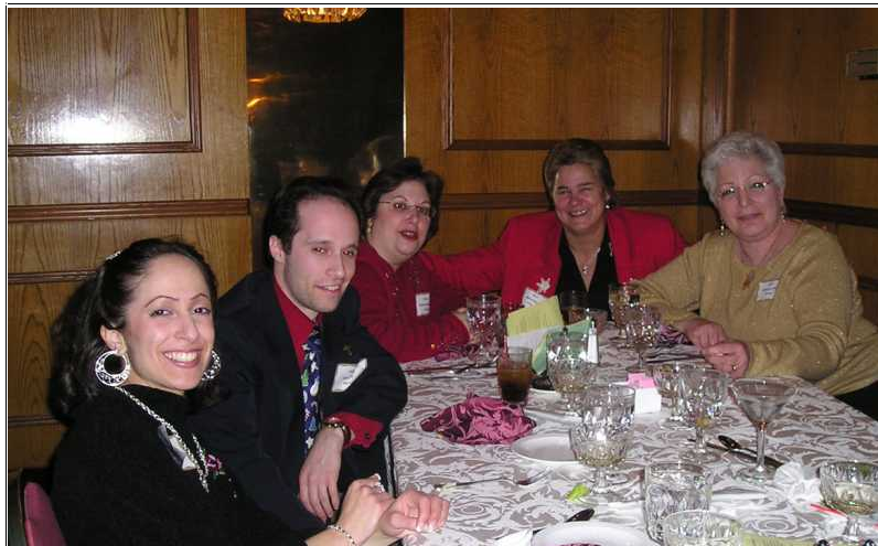
Staff from the Wantagh Public Library.