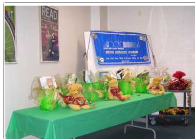
Some of the great raffle prizes distributed at the Media Division's Annual Brunch.

Classical Music Library offers tens of thousands of licensed recordings that listeners can listen to through their library website, along with companions to texts and themed, shared, or self-created playlists. Classical Music Reference Library contains Baker's dictionaries and the student encyclopedia; The Garland Encyclopedia of World Music Online will soon be available, and Smithsonian Global Sound contains Folkways recordings, historical perspective, and a children's collection.