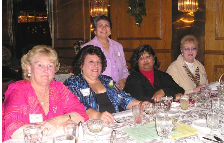
Members of the Clerical Services Division Executive Board.