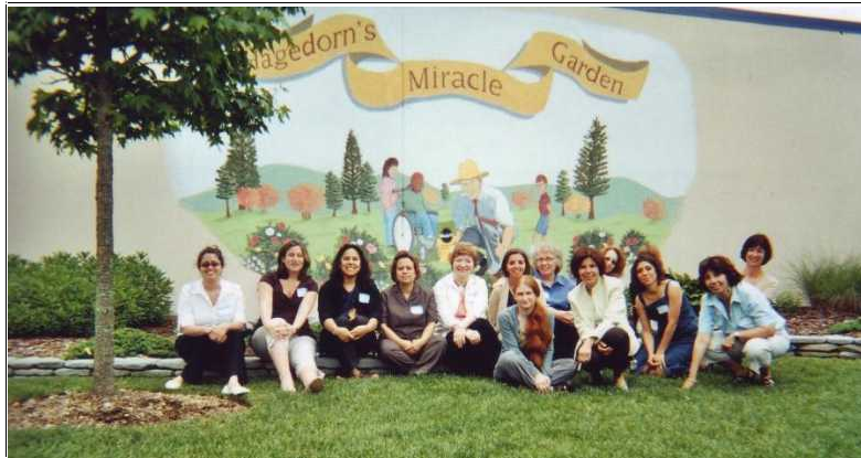
Children's Services Division members at the Hagedorn Little Village School.