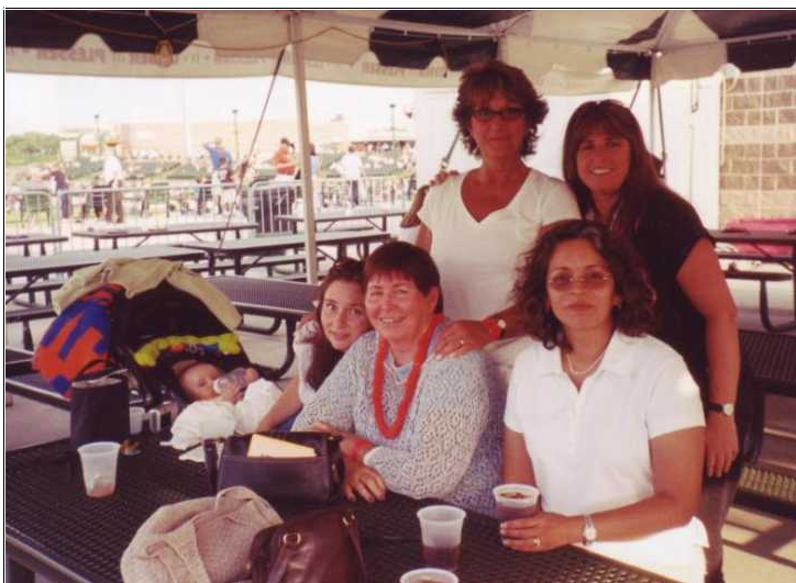
Staff members from the Freeport Memorial Library at the Long Island Ducks Game and Picnic.