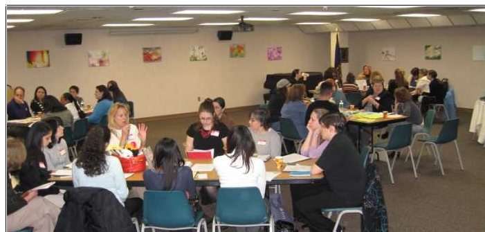
"I'm New...What Do I Do?" Workshop - November 19, 2007