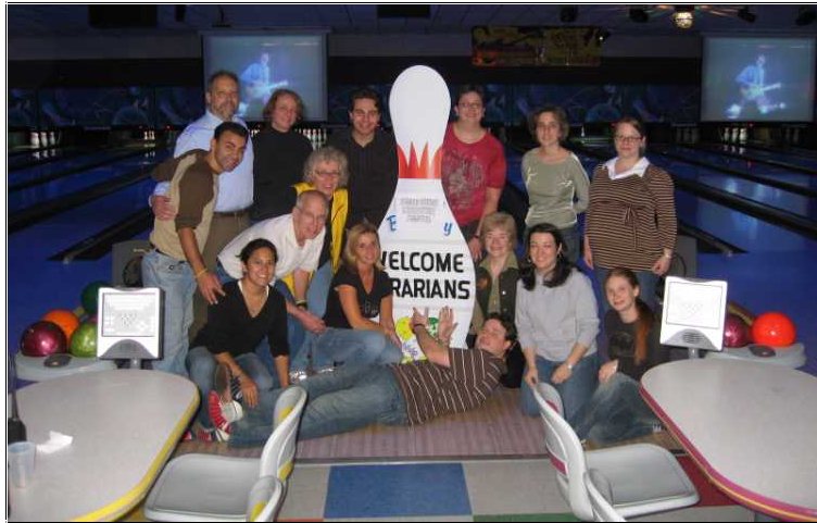
Farmingdale Lanes welcomes librarians.