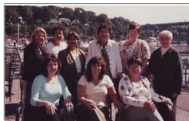
NCLA Clerical Division at Sunset Cove, Tarrytown, September 20, 2007.