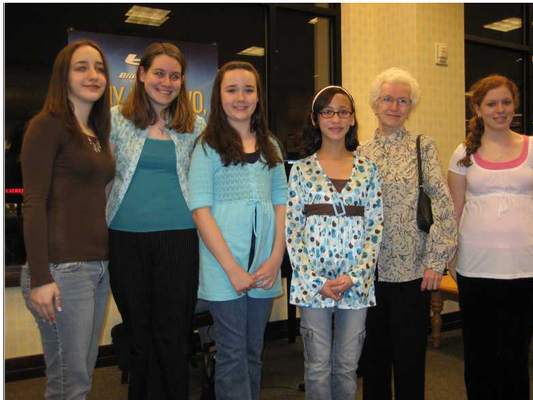
Winners at the Intellectual Freedom Committee Essay Contest Reception.