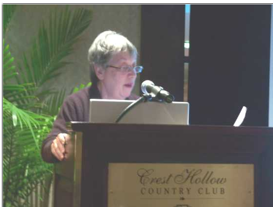
Children's Author Robie Harris talks about creating children's picture books.