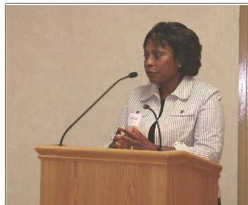
Assemblywoman Earlene Hooper (18 A.D.) speaks about the tough economic times facing Long Island.