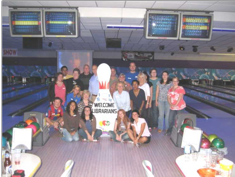
Nassau CSD and YASD librarians enjoy a fun evening of bowling, munchies, and good friends.

On Friday, September 19, 2008, librarians hit Farmingdale Lanes for a night of bowling!