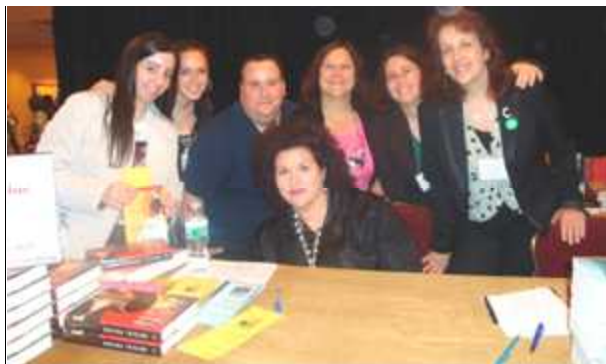
← Adriana Trigiani surrounded by her fans.