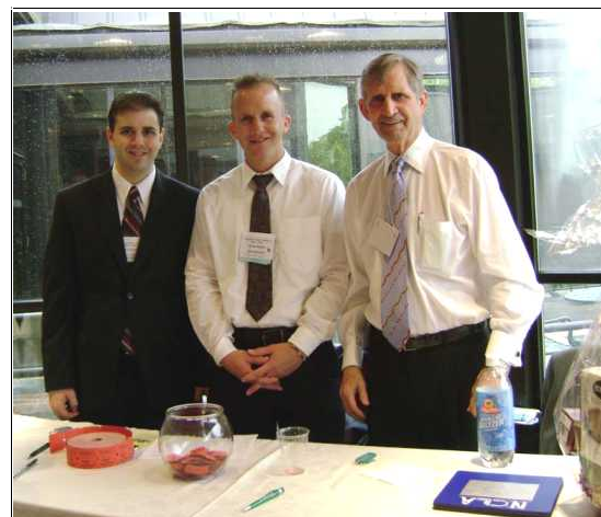
NCLA Academic & Special Libraries Division Table.