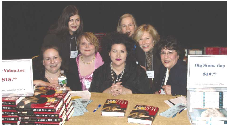
Keynote Speaker Adriana Trigiani with librarians from The Bryant Library.