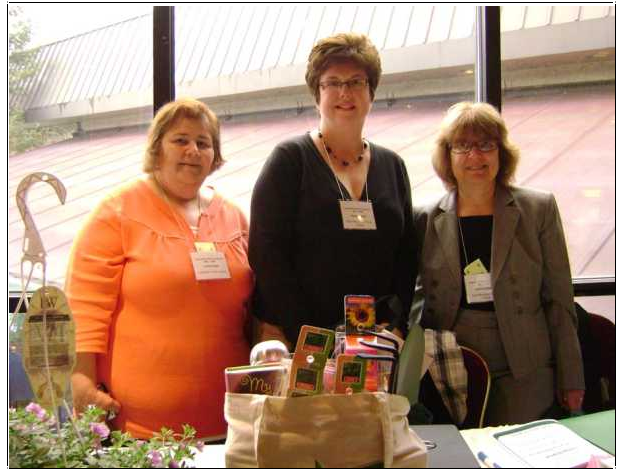
NCLA Children's Services Division Table.