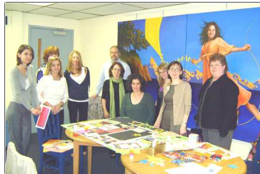
YASD Librarians work on YASD display board for Long Island Library Conference.