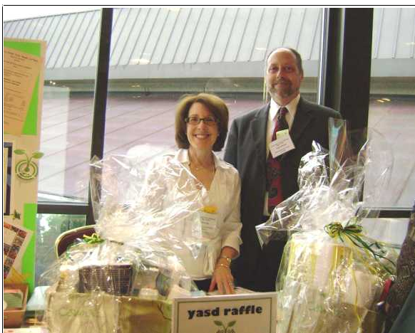
NCLA Young Adult Services Division Table.