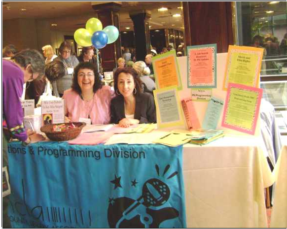
NCLA PR/Programming Division Table.