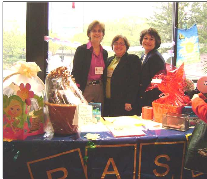
NCLA Reference & Adult Services Division Table.