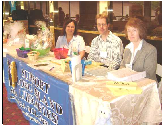
NCLA Table at the Long Island Library Conference