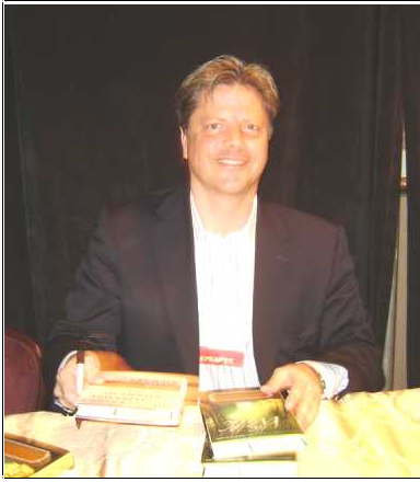
Richard Paul Evans Keynote Speaker